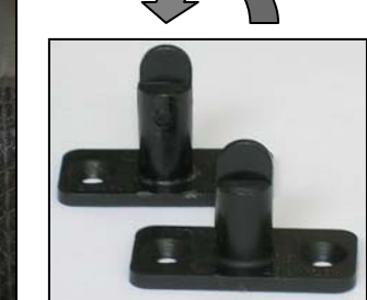
MOVEABLE TAB FACES DOWNWARD TO LOCK

Moveable tab opens & closes for secure installation & easy removal to clean.